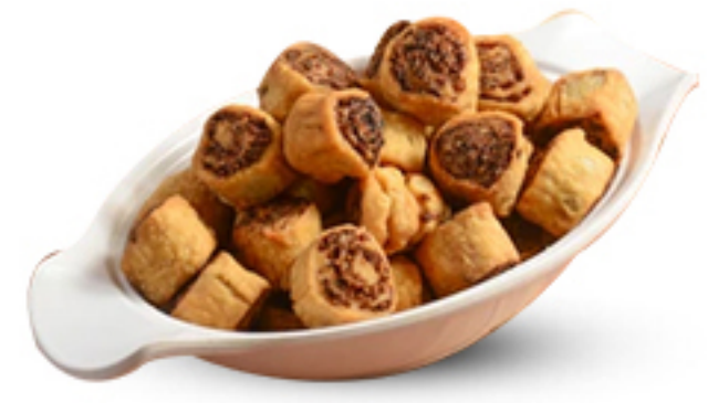
Bhakarwadi 1kg = Rs 240/-