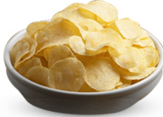
Aaloo Chips 1kg = Rs 350/-