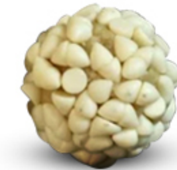
Kaju Cadbury Laddu