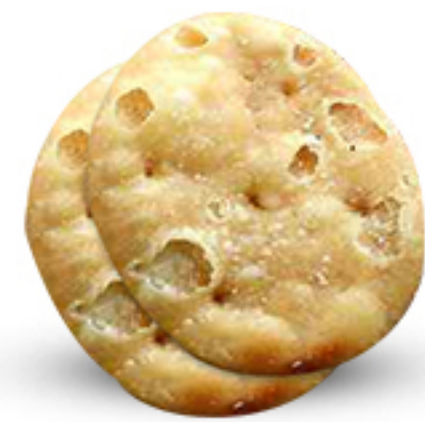
Chaat Papdi 1kg = Rs 200/-