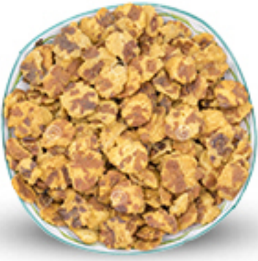
Chana Chips 1 kg = Rs 250/-