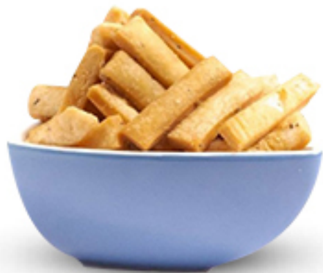
Saloni 1 kg = Rs. 200/-