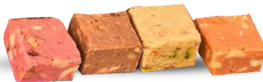
Kaju Bites : Rose, Mawa, Plain Horlicks