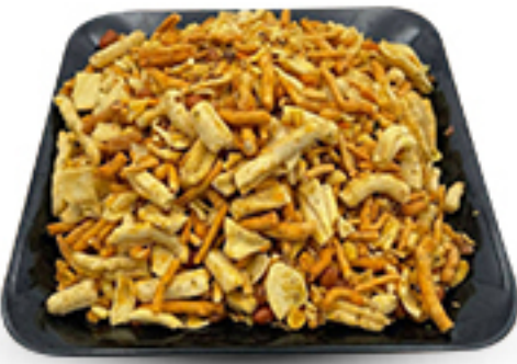
All in One Mixture