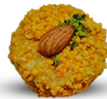
Kaju Kesar Patra