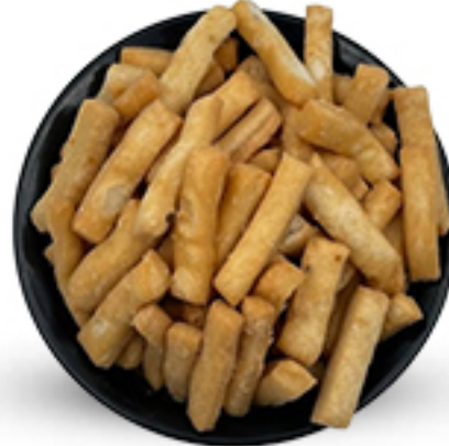
Sakkar Para 1kg = Rs 200/-