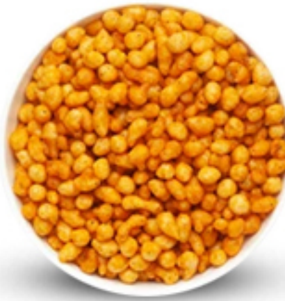
Raita Bundi 1kg = Rs 240/-