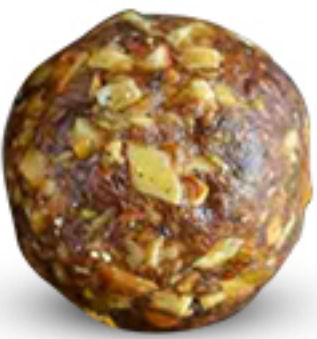
Dry Fruit Khajur Laddu