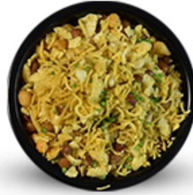
Khatta Meetha Mixture