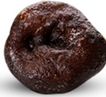
Desi Ghee Khoya Jalebi