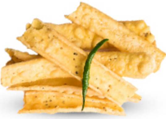
Fafda 1 kg = Rs 320/-