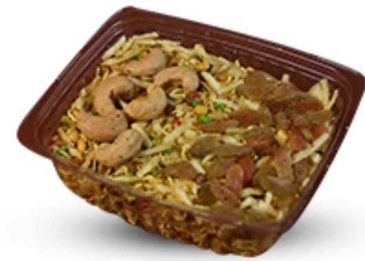
Shimla Kashmiri Mixture