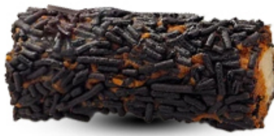
Kaju Chocolate Roll