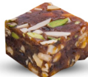
Khajur Sugar less