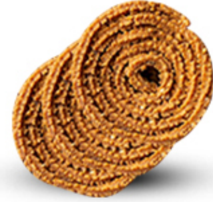
Chakoli 1kg = Rs 200/-