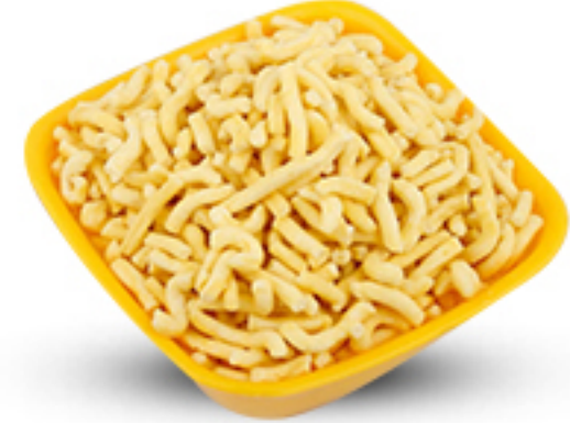
Bhavnagri Gathiya 1kg = Rs 240/-