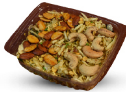
Badam Lacha Mixture