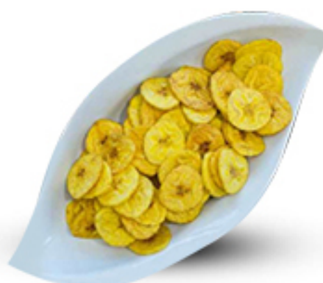
Kela Chips 1kg = Rs 350/-