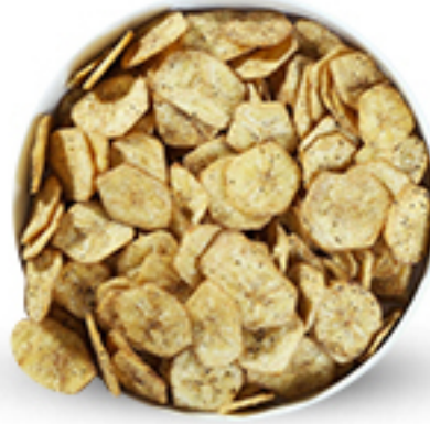
Cheese Kela Chips 1kg = Rs 350/-