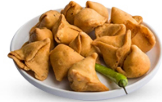
Mini Samosa 1kg = Rs 240/-