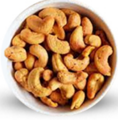
Kaju Fry 1kg = Rs 1000/-