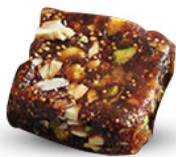
Anjeer Sugar less