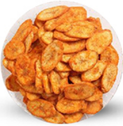
Tomato Kela Chips