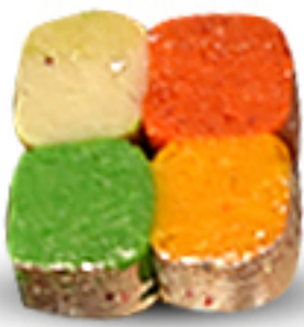
Kaju 4 star