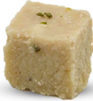
Mawa Pista Barfi