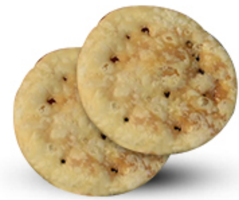
Masala puri 1kg = Rs 240/-