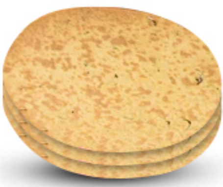
Khakhra 1 kg = Rs. 300/-