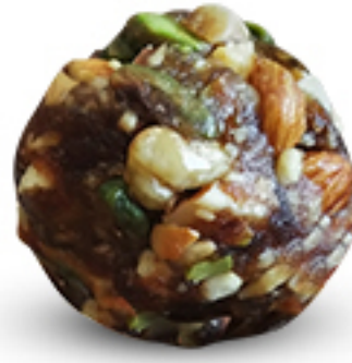
Dry Fruit Honey Laddu