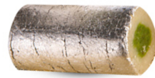
Kaju Pista Roll