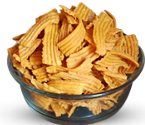
Moong Chips 1kg = Rs 300/-