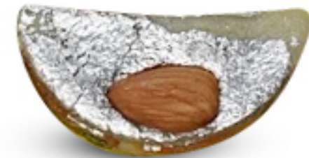
Dry Fruit Kaju Pastry