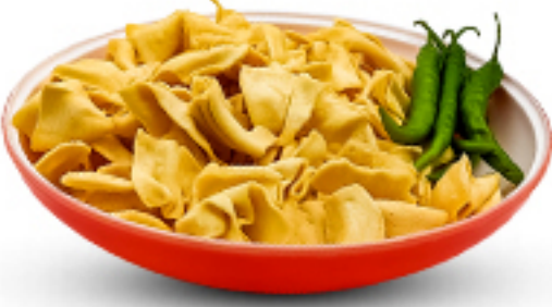
Papdi 1 kg = Rs. 240/-