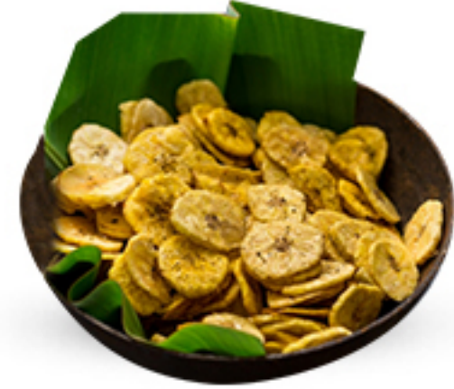
Kela Chips Masala 1kg = Rs 350/-