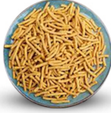
Medium Sev 1kg = Rs 240/-