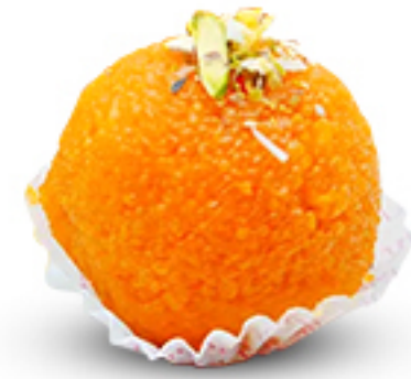
Kesar Bundi Laddu