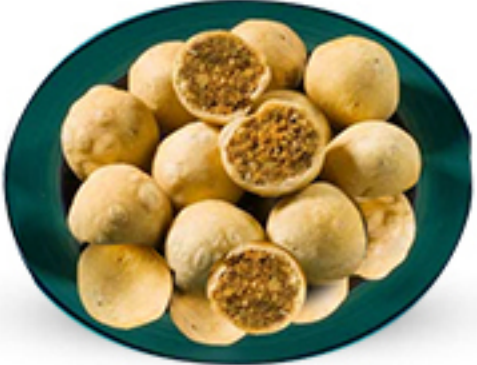
Mini Kachori 1 kg = Rs. 240/-