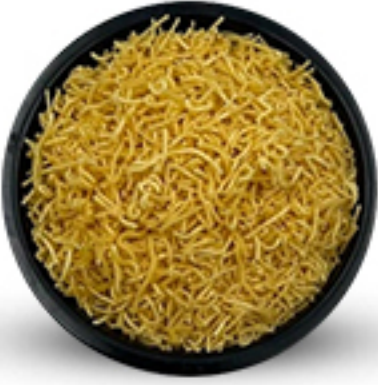
Barik Sev 1 kg = Rs. 240/-