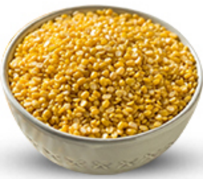
Moong Daal 1 kg = Rs. 250/-